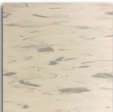
DX 1117 LIGHT BEIGE