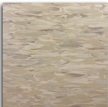
DX 1102 BEIGE & COPPER