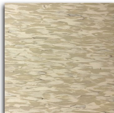
DX 165 YELLOW BEIGE