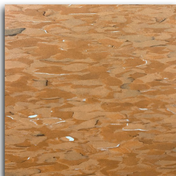
DX 194 COPPER ORANGE