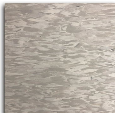
DX 157 LIGHT KHAKI