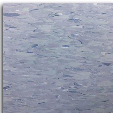
DX 1109 ICE BLUE