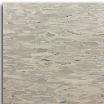
DX 154 GREY BEIGE